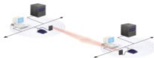
The use of directional antennas

One last item of wireless LAN equipment to consider is the directional antenna. Let's suppose you had a wireless LAN in your building A and wanted to extend it to a leased building B, one mile away. One solution might be to install a directional antenna on each building, each antenna targeting the other. The antenna on A is connected to your wired network via an access point. The antenna on B is similarly connected to an access point in that building, which enables wireless LAN connectivity in that facility.