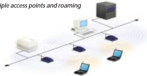
Multiple access points and roaming

To solve particular problems of topology, the network designer might choose to use Extension Points to augment the network of access points. Extension Points look and function like access points, but they are not tethered to the wired network as are APs. EPs function just as their name implies: they extend the range of the network by relaying signals from a client to an AP or another EP. EPs may be strung together in order to pass along messaging from an AP to far-flung clients, just as humans in a bucket brigade pass pails of water hand-to-hand from a water source to a fire.