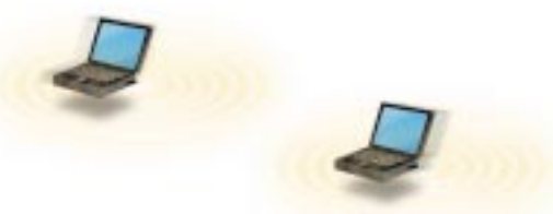
A wireless peer-to-peer network

Installing an access point can extend the range of an ad hoc network, effectively doubling the range at which the devices can communicate. Since the access point is connected to the wired network each client would have access to server resources as well as to other clients. Each access point can accommodate many clients; the specific number depends on the number and nature of the transmissions involved. Many real-world applications exist where a single access point services from 15-50 client devices.