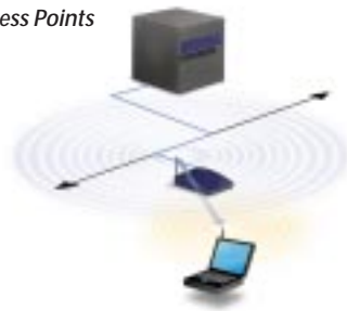
Clients and Access Points

Access points have a finite range, on the order of 500 feet indoor and 1000 feet outdoors. In a very large facility such as a warehouse, or on a college campus it will probably be necessary to install more than one access point. Access point